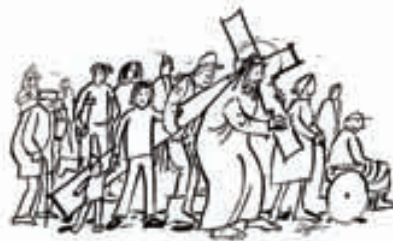
Way of the Cross every Friday of Lent after the 7 PM Mass St. Joan of Arc School Chapel

“Lent is a fitting occasion for all of us to undertake a journey of conversion, giving sincere consideration to this Gospel passage”, concluded Pope Francis. “Let us renew the promises of our Baptism: renouncing Satan and all his works and seduction, to walk the path of God to reach Easter in the joy of the Spirit”.